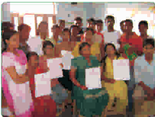
Beneficiaries with SCVT Certificate of DTTE Sponsored Vocational Course