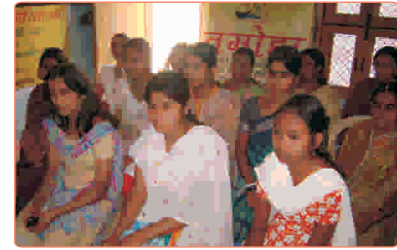
Women getting aware about their rights & duties in AGP funded by DSWB.

Tamoha has organised Awareness Generation Camps in the area of west Delhi with the grant support of Delhi Social Welfare Board to empower the women in education, health, food & nutrition, legal rights, income generation activities, prevent female foeticide & micro savings & credit practice. The professional resource persons from different stream had shared their experience with the women about the facts & opportunities to resolve the problems. Targeted that literacy percentage from 47 % will be improved to 100%, each women has to save at least Rs. 2 per day, 100 % prevention of female foeticide, per capita income from Rs. 50 per day will be improved to at least Rs. 200 per day, no violence will be tolerated against any woman.