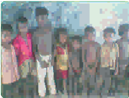
Children from Birhor Families of Jharkhand before taking care by the organisation