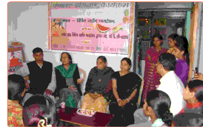
Women of SC/ST Families are getting training by the staff of Food & Nutrition Board.

Organisation with support of the board has organised 2 week training camp for the SC/ST women of the area for food preservation & preparation of nutritious foods. The expert trainer from the board trained them for the best output. Book for preparation of nutritious foods & Rs. 100 as stipend has been distributed to the beneficiaries. The certificates were also given to them. One award was also given to the project officer of Tamoha for its best efforts made for the upliftment of society especially for women empowerment practice.