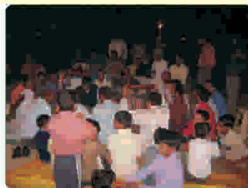
The celebrations after starting the Cluster Resource Center with internet facility for the latest information of schemes.

chance to implement newer and social work interventions in all means for the improved socio-economic condition of people of all levels in terms of social, economic, cultural, technological and innovative development strategies with the emergence of new technologies and social work interventions, our earlier concepts has been changed and improved so as to be capable of improving standard in all respect. Our organization also wishes to take a step into the social work methods based on qualitative technology based innovative approaches. We also wish to find new channels and space for vision based new innovation. Our working strategies indicate TAMOHA's quality of achievement, strong mass base, transparency, dedication and commitment of the members & the staff. This is the time to express the words of thanks to all our donor agencies, individuals, departments, of state and central governments, different banks, like minded organizations and our