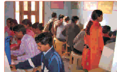
Beneficiaries of Computer Training in the Practical Class Room funded by DTTE GNCTD.

NBT the central govt. institution has supported to the organisation by providing books for the library run for the benefit of community to enhance the knowledge in various fields. The trust also made available their mobile book exhibition van at the premisses of the workshop organised for Book Promotion by Tamoha.